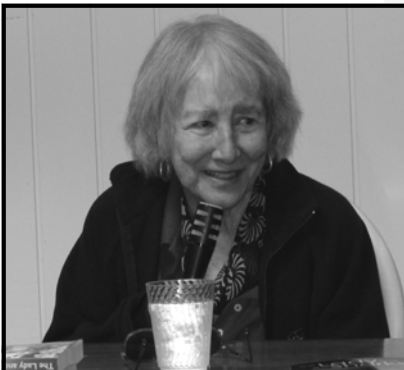
Dr. Eugenie Clark